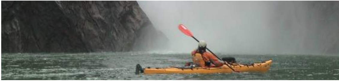
Sea kayak Tagua Tagua Lake